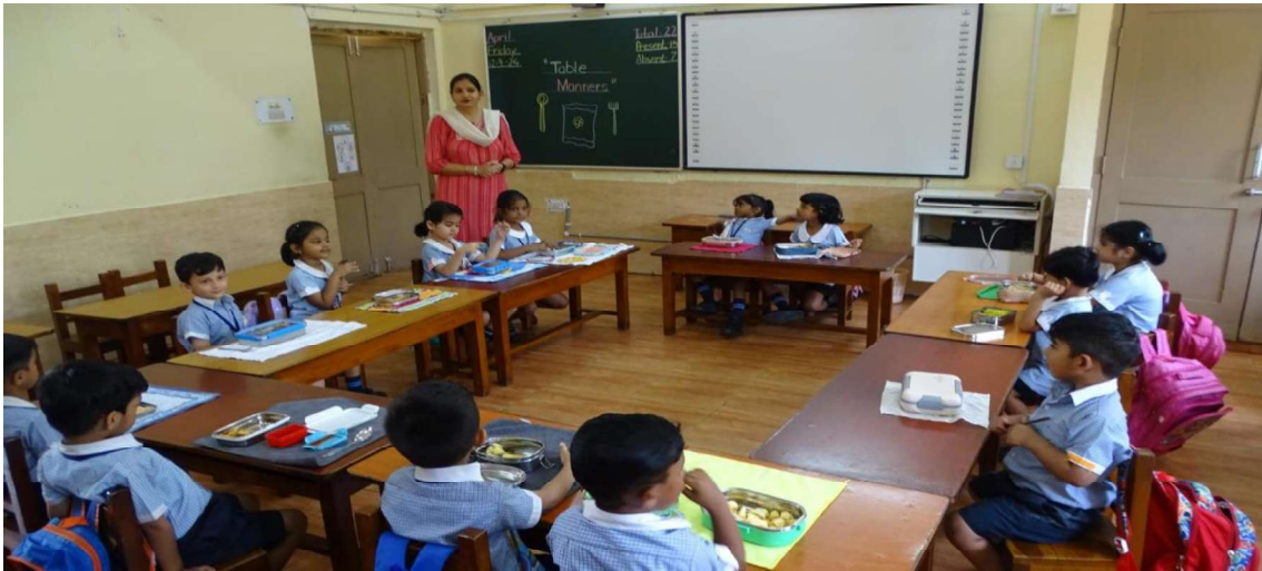
Table manners activity was conducted for all Balvatika III classes on 16th April. Teacher explained the etiquette of eating on the table. They were taught how to spread the napkin on the table and keep the tiffin box on it. It helps them to learn to eat in proper manner.