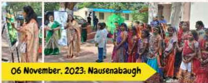
06 November, 2023: Nausenabaugh