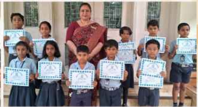
Class 3 Shooting the Ball and Standing Broad Jump