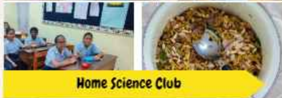
Home Science Club