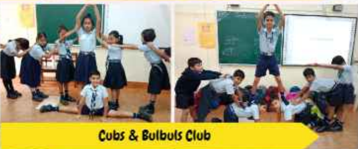
Cubs & Bulbuls Club