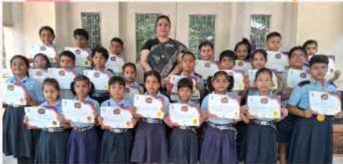
State Level Handwriting Winners