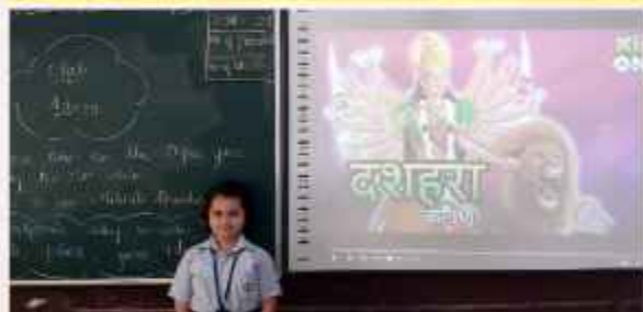
Speak on Dusshera