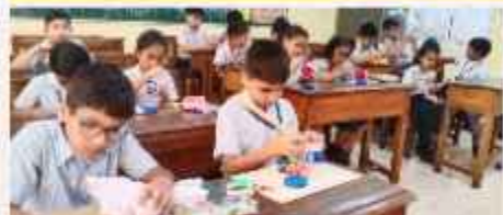
Prakriti (Nature's Club)