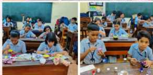
Kalakriti (Art & Craft)