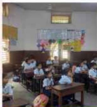
Story-Telling - Dusshera