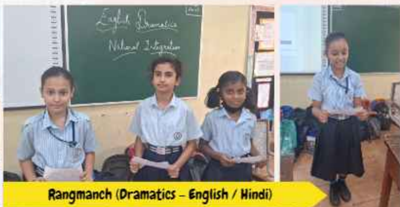
Rangmanch (Dramatics - English / Hindi)