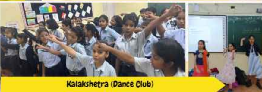
Kalakshetra (Dance Club)