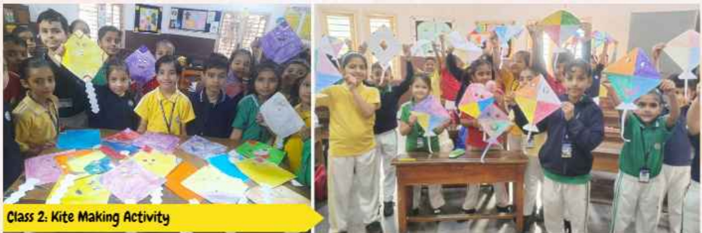
Class 2: Kite Making Activity