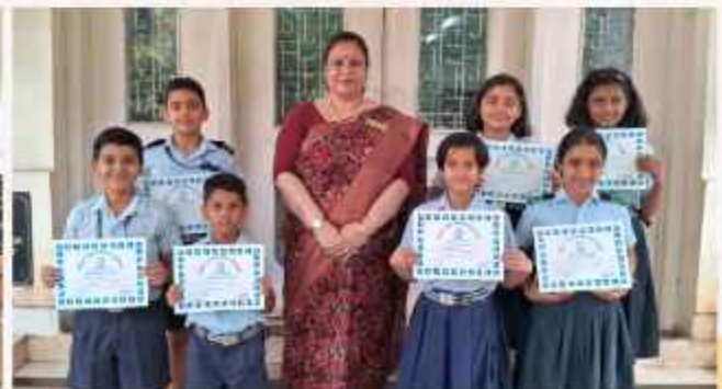
Class 5 Burpees