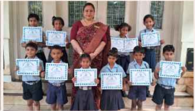
Class 1 Shooting the Ball and Standing Broad Jump