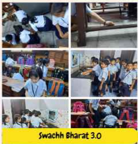
Swachh Bharat 3.0