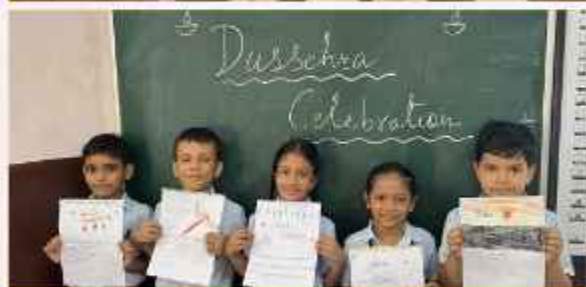
Dusshera Writing Skills