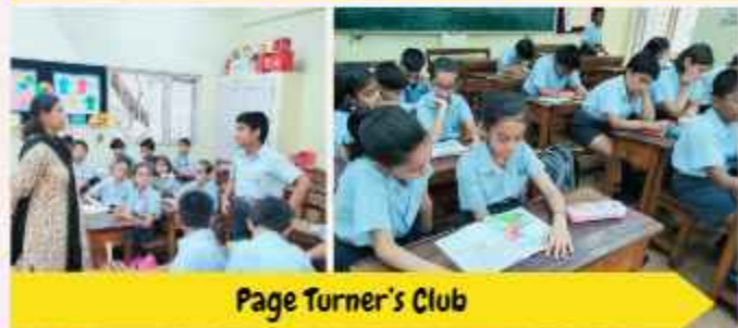
Page Turner's Club