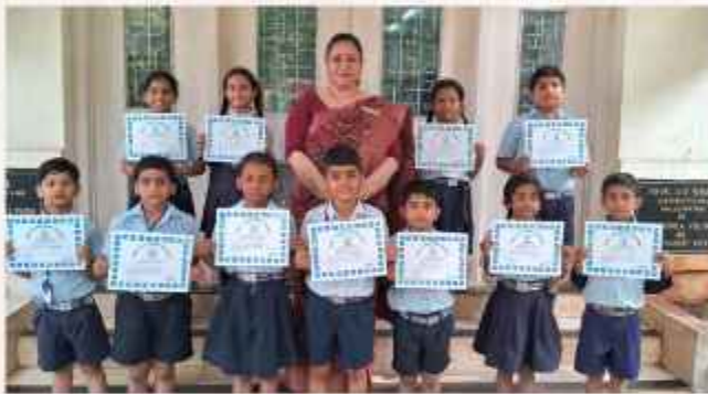
Class 2 Shooting the Ball and Standing Broad Jump