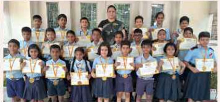
State Level Winners