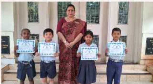
Class 4 Burpees