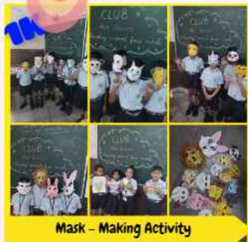
Mask - Making Activity