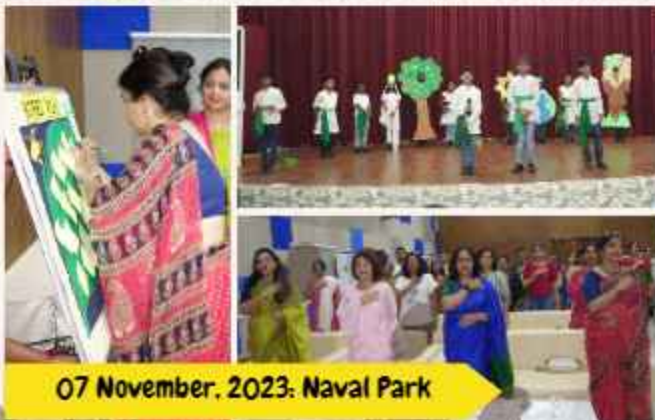
07 November, 2023: Naval Park