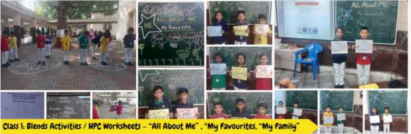
Class 1: Blends Activities / HPC Worksheets - "All About Me", "My Favourites", "My Family"